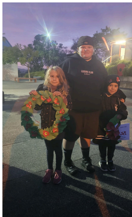
Dawn Service at Wellsford Pakiri School Wreath Layers

Cell phones have always been banned from school. Just to reassure you, Pakiri School has structured literacy and mathematics teaching at all year levels, as well as a vast array of engaging learning activities for all children, with the aim of meeting the dynamic and differentiated needs of learners across the school. We will maintain our learning direction, which meets the needs of all tamariki and the expectations of the government, with continued and regular review.